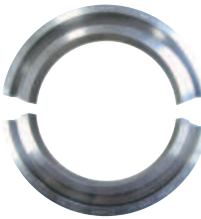
Aluminum clamping collar for RPG 8.6