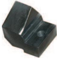
Tool holder WH