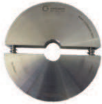
Special-steel clamping collar for RPG 3.0 (battery)

Please check the outer diameter of the pipes before ordering the clamping collars.