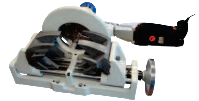
RPG 4.5 S